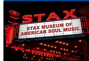
Visit to the STAX Museum of American Soul Music