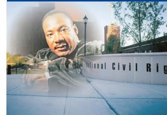
Visit to the National Civil Rights Museum