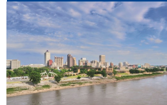
Guided Tour of Memphis

Day 6: Today, after enjoying a Continental Breakfast, you depart for home... A perfect time to chat with your friends about all the fun things you've done and where your next group trip will take you!