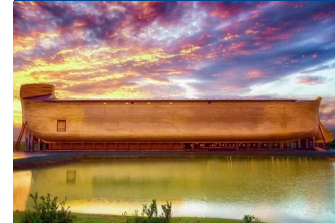
Enjoy a visit to the Famous Ark Encounter!