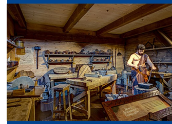
View from Inside the Ark Encounter