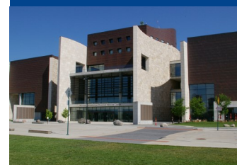
Incredible National Underground Railroad Freedom Center

Departure: Holiday Cruises and Tours, 2522 Capital Circle NE, Tallahassee, FL @ 8 am