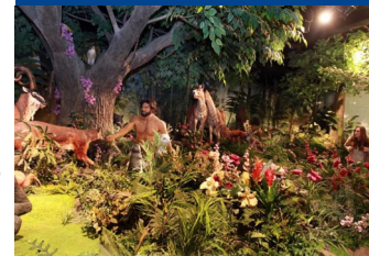
Visit to the Amazing Creation Museum!